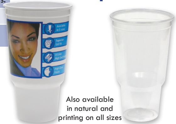
Also available in natural and printing on all sizes