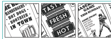
Newspaper™ (three rotating design)

*Ounce sizes are approximate dry weight measurements